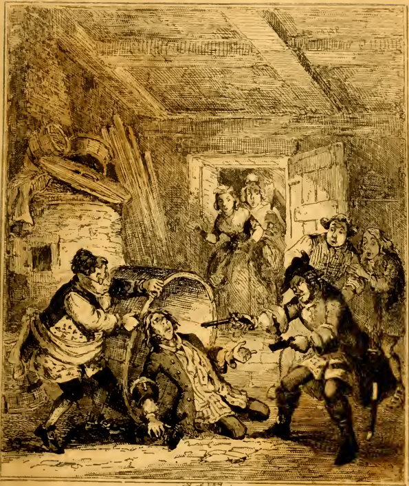
Scout's Wild unkenning Butler